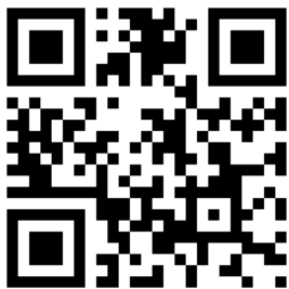
QR Code for Launches.Mobi